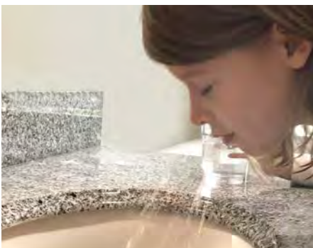
9. Rinse with water and SPIT OUT

For more asthma videos, handouts, tutorials and resources, visit Lung.org/asthma .