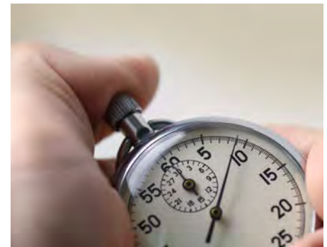
If you need another puff of medicine, wait 1 minute then repeat steps 5-9.