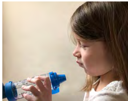
8. Hold your breath for 10 seconds if you can. Then breathe out slowly.