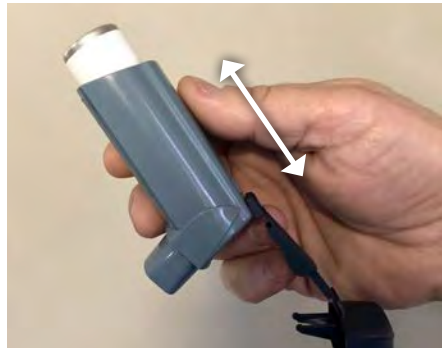
2. Shake the inhaler for 5 seconds