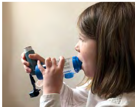
5. Close lips around mouthpiece