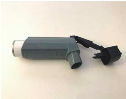
1. Take the cap off the inhaler